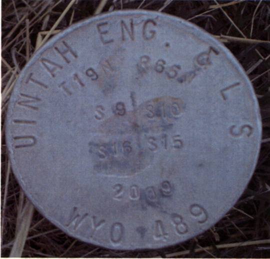
FOUND: ALUMINUM CAP, PLS 489 IN NORTH SOUTH FENCE LINE